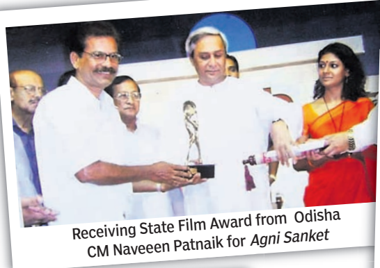
Receiving State Film Award from Odisha CM Naveen Patnaik for Agni Sanket

Excerpts: ■ Please tell us about Ajati and how it is different from your previous movies? ■ I love to make films on the intricacies of human relationships and Ajati is no different. But it is certainly different from the ones I made earlier. You have to wait for the film's release to learn more as I can't divulge in detail at the moment. But I can say that the relationship between the members of so-called civilised society and the forest dwellers forms the crux of the enterprise. We often construe the simplicity of the forest dwellers as their foolishness which is not. They may be simple but they are not fools. Moreover, they are wiser than the urban people more often than not. ■ How did you come up with the idea of making Ajati ? ■ It is not a story with a contemporary theme. The plot was in my mind when I was doing a job which involved regular but limited interactions with the tribal population. Then I was curious what they would be thinking about us, the 'civilised' people. The disparity between them and us made me think about this film at that time but I couldn't get the opportunity to work on the subject. ■ Whether it is Hakim Babu or Shesha Pratikhyia , your subjects were always ahead of their times. Can we expect it from Ajati also? ■ Yes, it is ahead of its time like most of my films. But the viewers need to watch the movie in theatres to feel the difference. Apart from the subject, I have a good combination of actors across generations. While Samaresh (Routray)