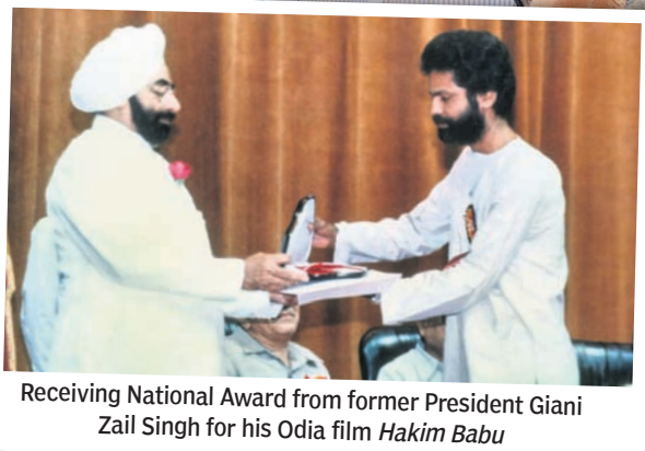
Receiving National Award from former President Zail Singh for his Odia film Hakim Babu