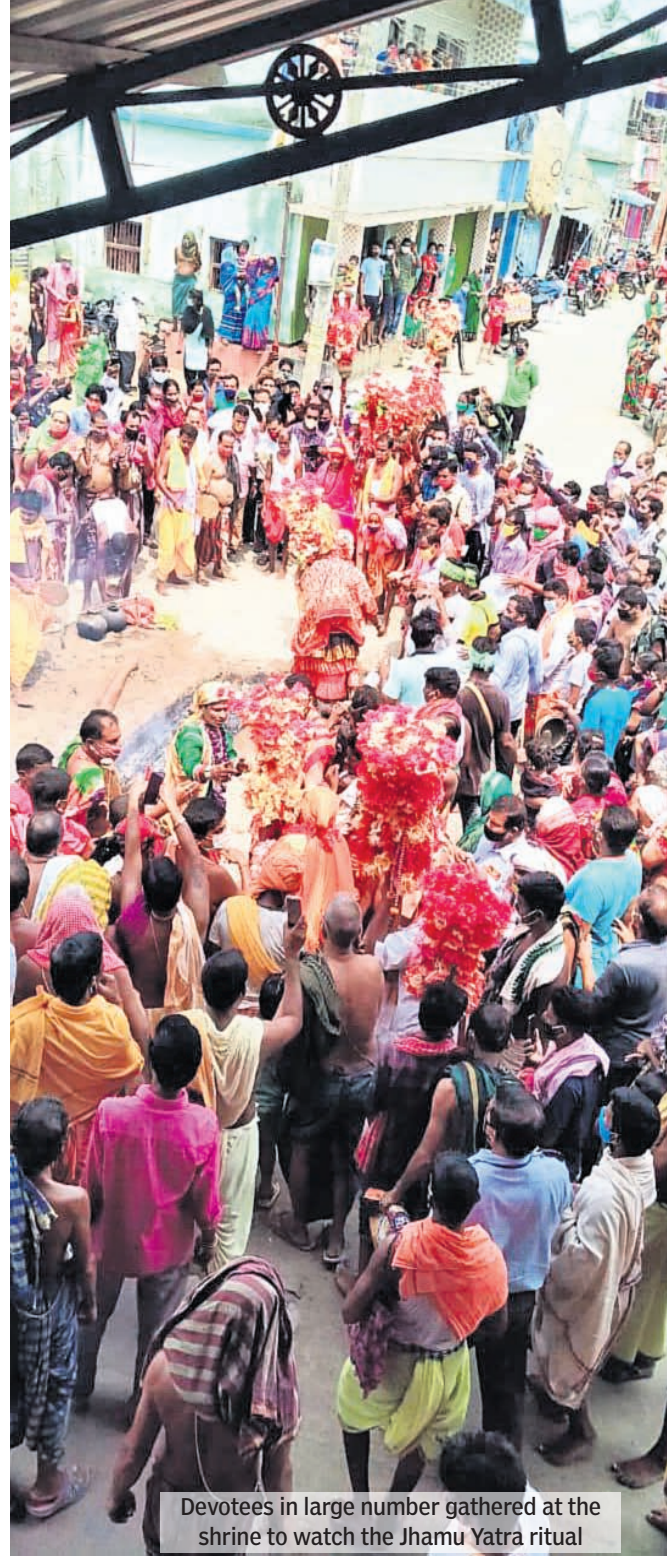
Devotees in large number gathered at the shrine to watch the Jhamu Yatra ritual

They stop off at Deuli Mutt, known as the entudisala (birthplace) of Lord Jagannath, near Maa Mangala's abode at Kakatpur. It is when Maa Mangala comes in their dream and guides them in which direction they need to move to get the timber."