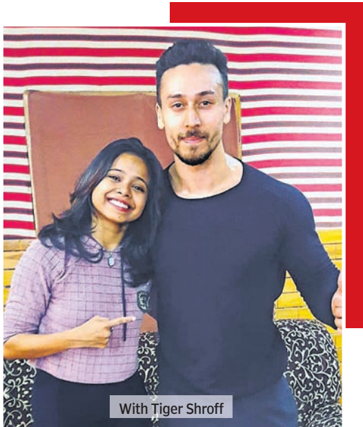
With Tiger Shroff

Away from the hustle and bustle of crowded city life, I love to spend time in the lap of nature. So, I often have to travel extensively to explore the raw beauty of lesser known destinations.