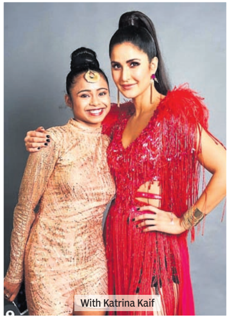
With Katrina Kaif

Though I go for my regular workout sessions on weekdays, on Sundays I spend a few extra hours to burn the extra calories.