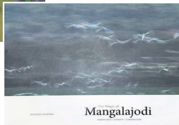
Cover of the book

For the unversed, Avinash, in collaboration with Panchami Manoo Ukil, a Bhubaneswar-based ed-