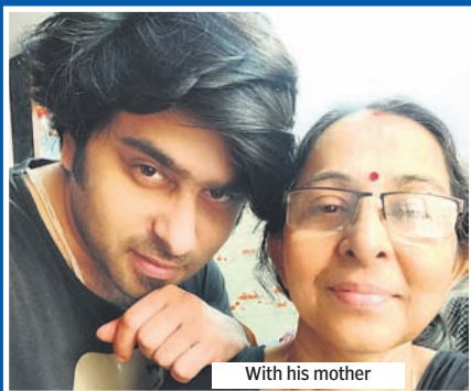
With his mother