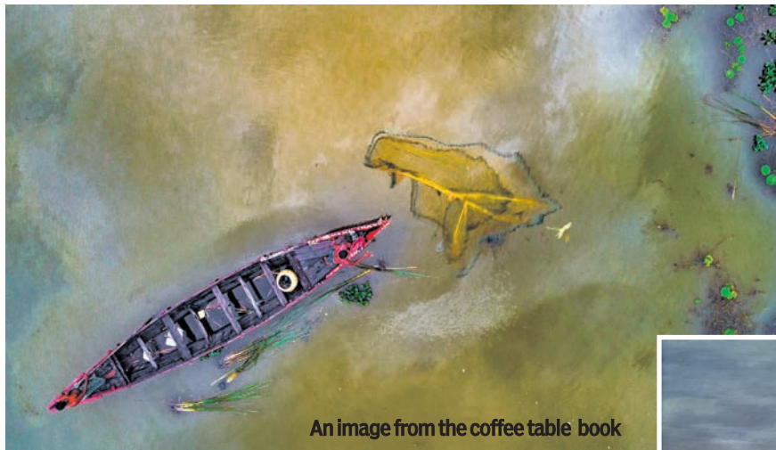
An image from the coffee table book

Nature and wildlife photographer Avinash Khemka has spent more than 300 nights over the last 10 years and captured nearly 10,000 images to present this stunningly beautiful coffee table book to the nature lovers