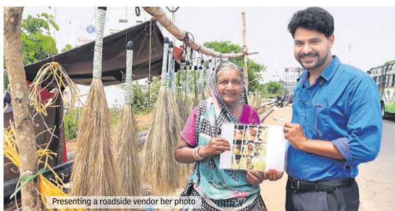
Presenting a roadside vendor her photo

I love to click unknown people, mostly those belonging to the lower rungs, and gift them their photos. When I give those photo frames, their joy and the infectious smiles on their faces are to be seen to be believed. It's a campaign of sorts for me to spread smiles and is called 'Tikie Khushi'.