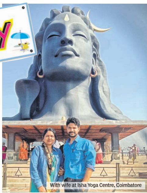
With wife at Isha Yoga Centre, Coimbatore