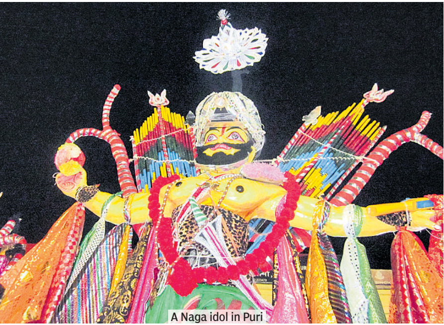
A Naga idol in Puri