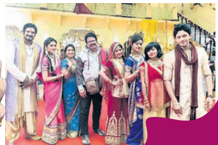
On the set of Nua Bohu with the artistes

Family tie One of the things I do on a holiday is catching up with family members. My younger brother, his wife, my niece, and others visit my sister's resort and have a fantastic time.