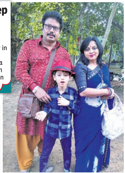
With wife and son

Extended sleep On a holiday, my son and I enjoy an extended sleep since he comes into my bed early in the morning to snuggle under the cover. An extra hour of napping with him helps me beat exhaustion and start the day afresh.