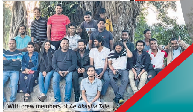
With crew members of Ae Akasha Tale

Reading new novels is one of my favourite pastimes. I also appreciate painting as a means of expressing myself. I enjoy listening to music and dancing on occasion. If I have time, I will also go on a solo date.