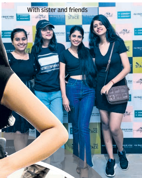
With sister and friends