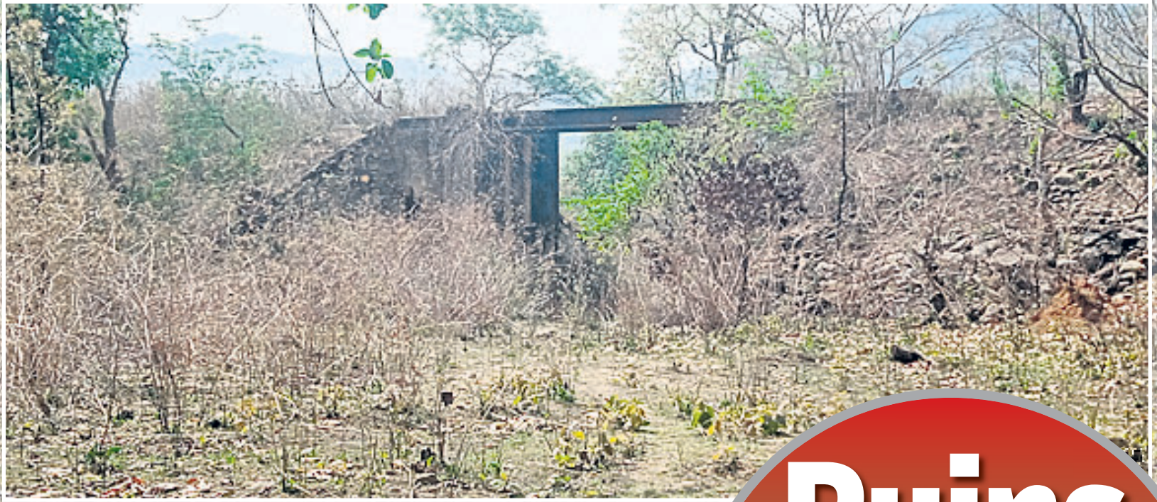
Remnants of the British-laid railway iron bridge near Talbandh