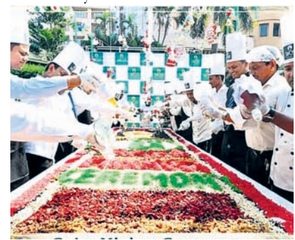
Swosti premium cake mixing

The tradition of cake mixing actually began in Europe. The whole family used to come together for this activity, which symbolised unity and hard work. The final mixture was then soaked in alcohol and preserved for weeks. Do you know that cake mixes were