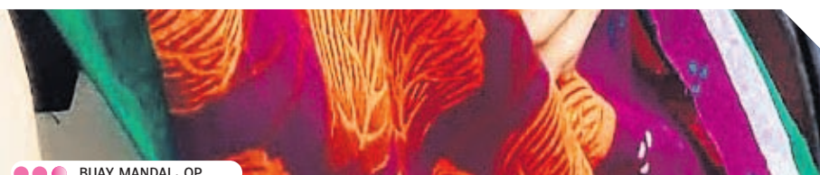
BIJAY MANDAL, OP

I reserve the evenings for my husband and son. We watch movies in theatres or dramas in auditoriums. After that, we love to indulge in a scrumptious dinner at a restaurant.