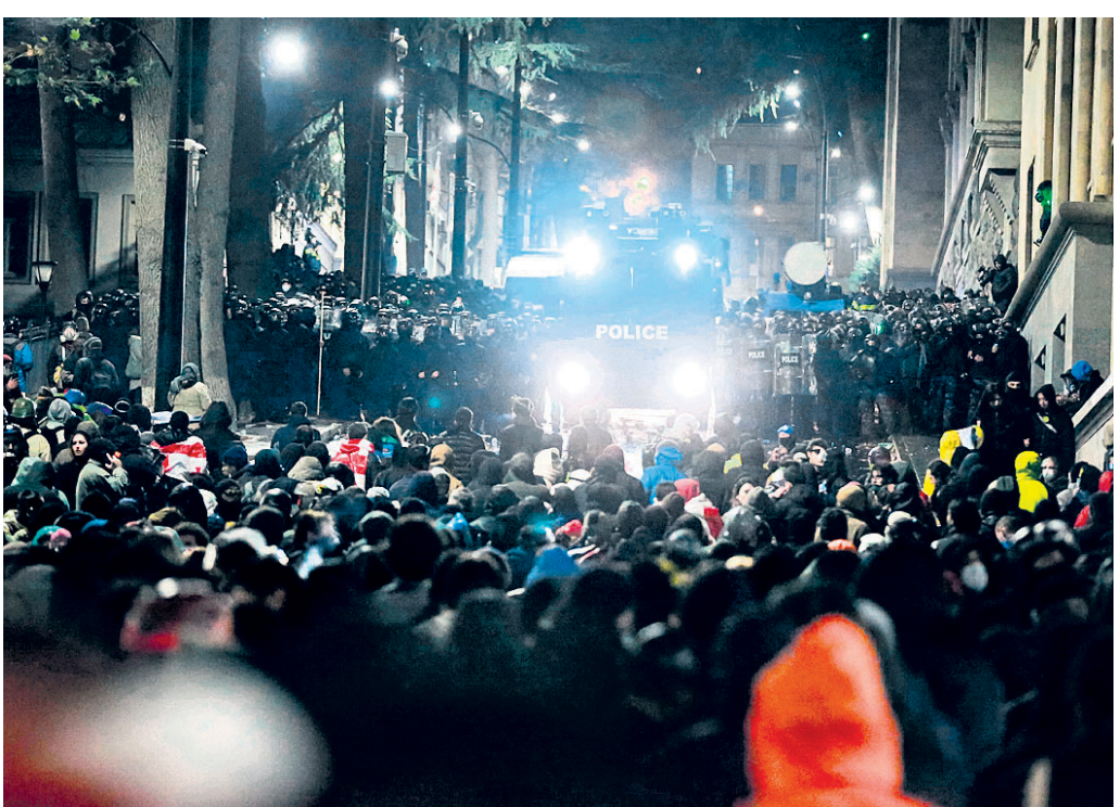
Police block demonstrators during a rally outside the parliament's building to protest the government's decision to suspend negotiations on joining the European Union for four years in Tbilisi, Georgia

Hamas leaders were expected to arrive in Cairo Saturday for ceasefire talks with Egyptian officials to explore ways to reach a deal that could secure the release of hostages in return for Palestinian prisoners.