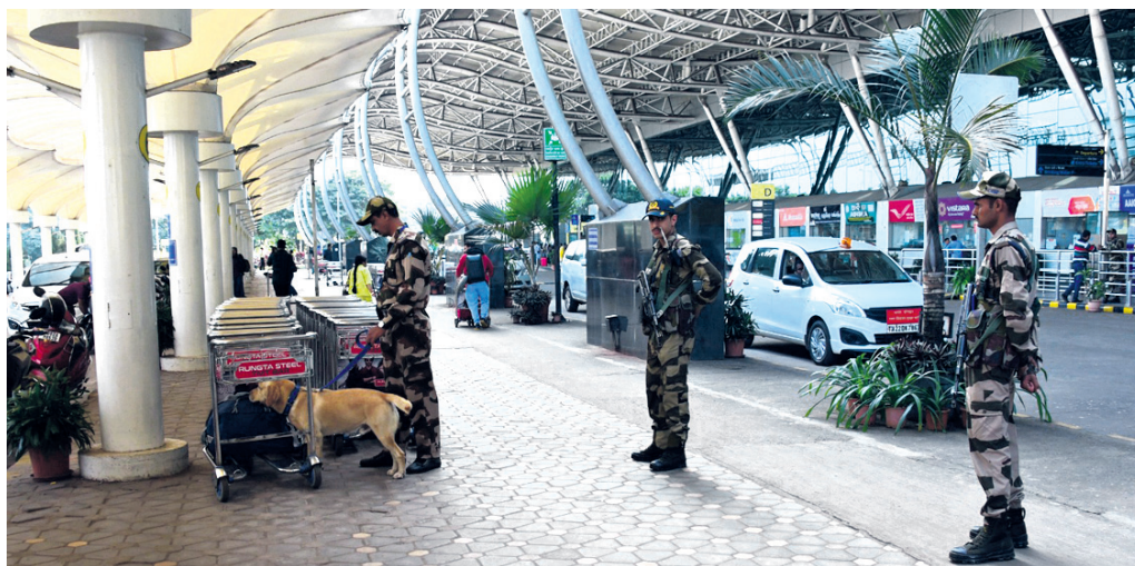
A sniffer dog checks an unclaimed bag at Biju Patnaik International Airport in Bhubaneswar, Saturday

Khalistani separatist Gurbatwant Singh Pannun is at it again. While the 59th DGP-IGP conference, attended by Prime Minister Narendra Modi, was underway, Pannun issued a fresh threat asking people to avoid Biju Patnaik International Airport December 1 as the facility is on his target. The threat came via an e-mail to a local journalist, leaving security officials in a tizzy. A couple of days ago, ahead of the national-level event, Pannun dubbed Bhubaneswar a "Terror City" claiming "Modi-Shah-Doval evil axis" had put it under threat with their participation