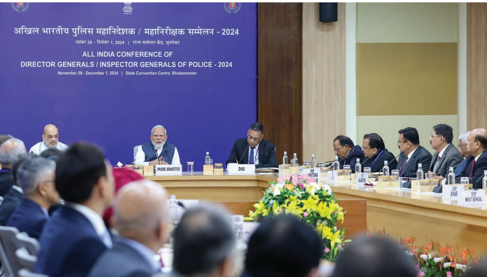
HIGH-LEVEL MEET: Prime Minister Narendra Modi addressing the All India Conference of Director Generals/ Inspector Generals of Police -2024 in Bhubaneswar, Saturday, while Union Home Minister Amit Shah looks on

Sindhu, Sen in finals PV Sindhu and Lakshya Sen make it to women's and men's singles finals, respectively, at Syed Modi Int'l Super 300 tournament SPORTS | BACK PAGE