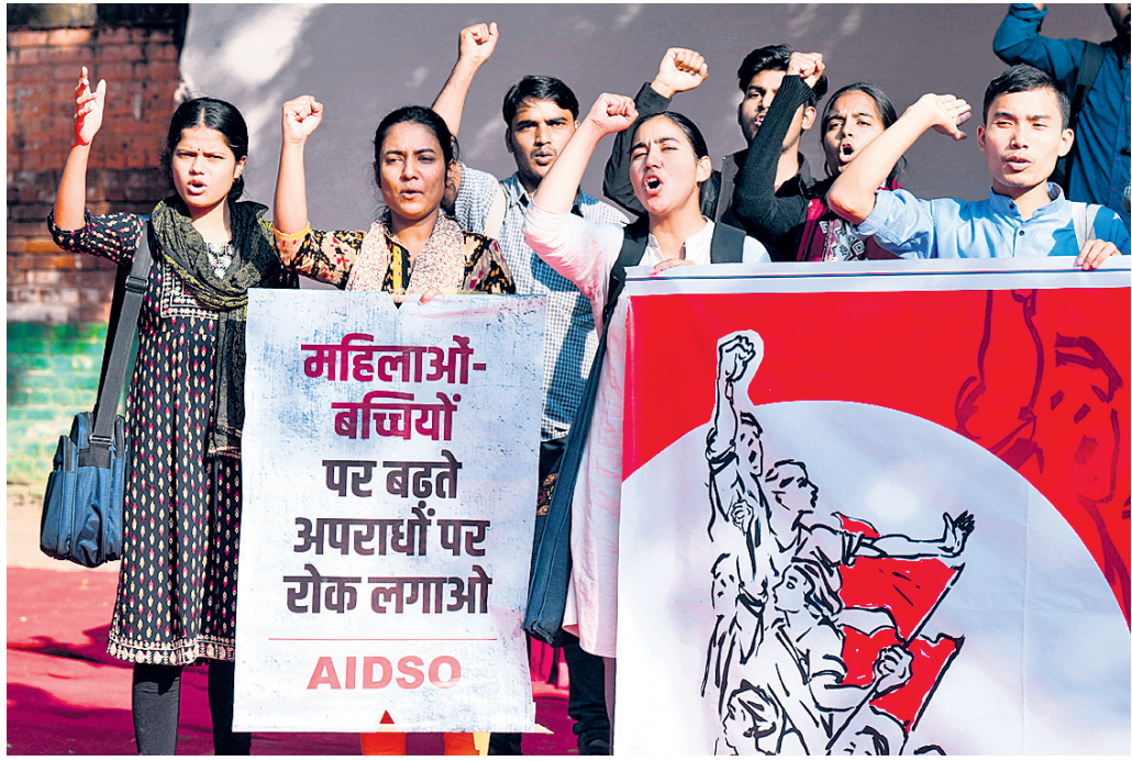
Students raise slogans during a protest against the 'National Education Policy (NEP) 2020' organised by the All India Democratic Students' Organisation (AIDSO), at Jantar Mantar in New Delhi

The Shamsi Shahi Masjid, which is built on an elevated area called Sotha Mohalla, is considered to be the highest structure in Budaun town.