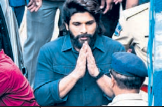
«Allu Arjun was arrested by the city police in connection with the death of the woman December 13 «The Telangana High Court granted him a four-week interim bail on the same day and he was released from a prison here December 14 morning

Allu Aravind expressed relief after speaking to the doctors, who informed them that the boy is recovering and can now