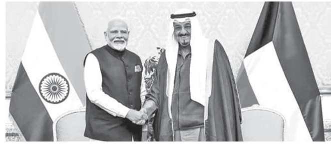
The strategic partnership, signed during the visit, aims at enhancing bilateral relations in all possible and potential sectors

Prime Minister Narendra Modi was on a two-day visit to Kuwait on the invitation of the Emir. It was a historic event inasmuch as an Indian Prime Minister was visiting the country after a long gap of 43 years; Indira Gandhi had visited Kuwait in 1981. During this visit, bilateral relations between the two countries were elevated to a strategic partnership. Prime Minister Modi was conferred with the highest honour of Kuwait, “The Order of Mubarak AL-Kabeer.”