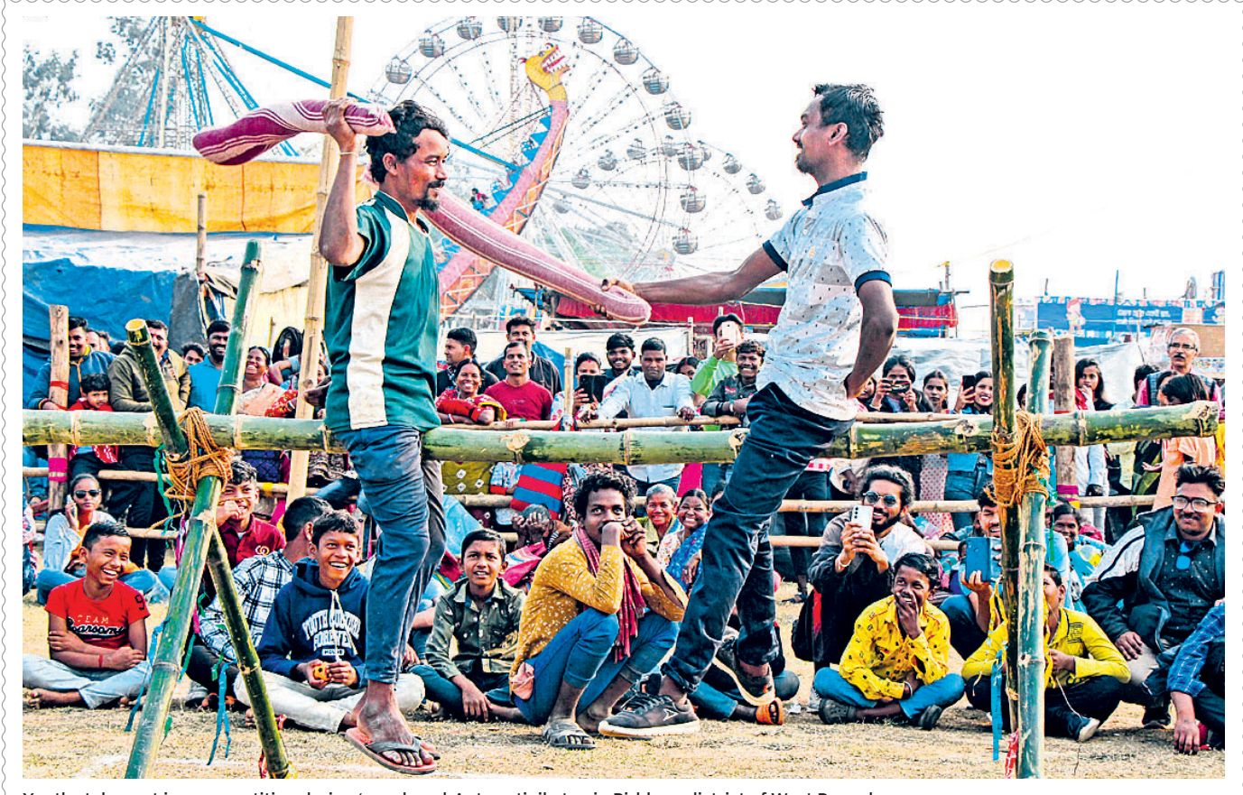
Youths take part in a competition during 'push mela' at santiniketan in Birbhum district of West Bengal

INDORE: Police have arrested a 23-year-old MBBS student in Madhya Pradesh's Indore for sending around Rs 8 lakh of cyber fraud money to a gang of Chinese youths by converting it into cryptocurrency, an official said Wednesday.