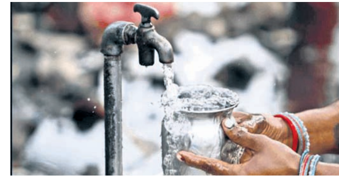
POST NEWS NETWORK

The foundation stone of the institute was laid by Vajpayee July 15, 2003. AIIMS-Bhubaneswar is noteworthy as the second AIIMS established in the country and the only one whose foundation stone was laid by the former PM himself.