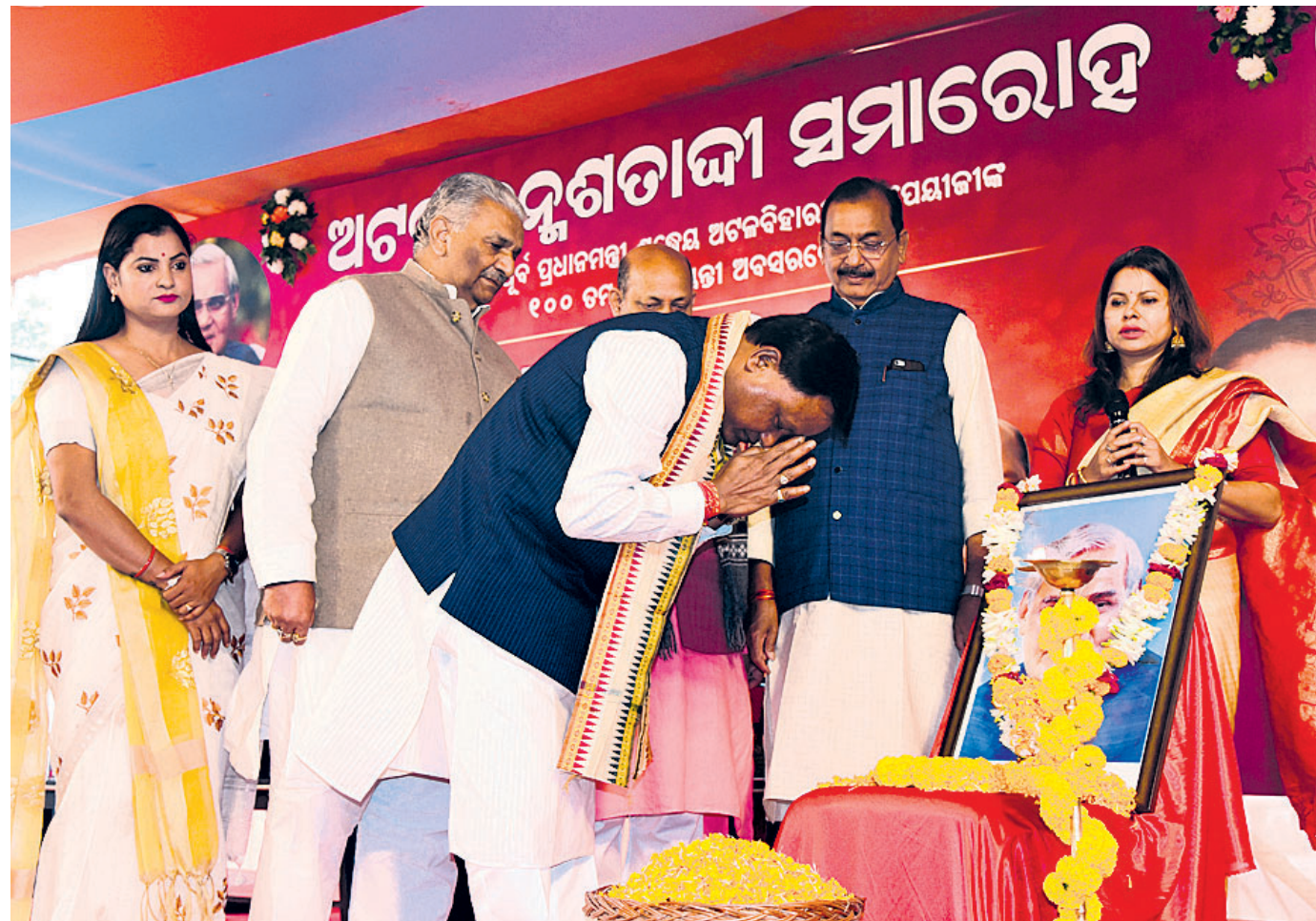
CM Mohan Charan Majhi paying homage to former prime minister Atal Bihari Vajpayee at BJP office in Bhubaneswar, Wednesday

In a post on X, Majhi paid tributes to the former prime minister and extended heartiest congratulations and best wishes to everyone on the occasion of Good Governance Day.