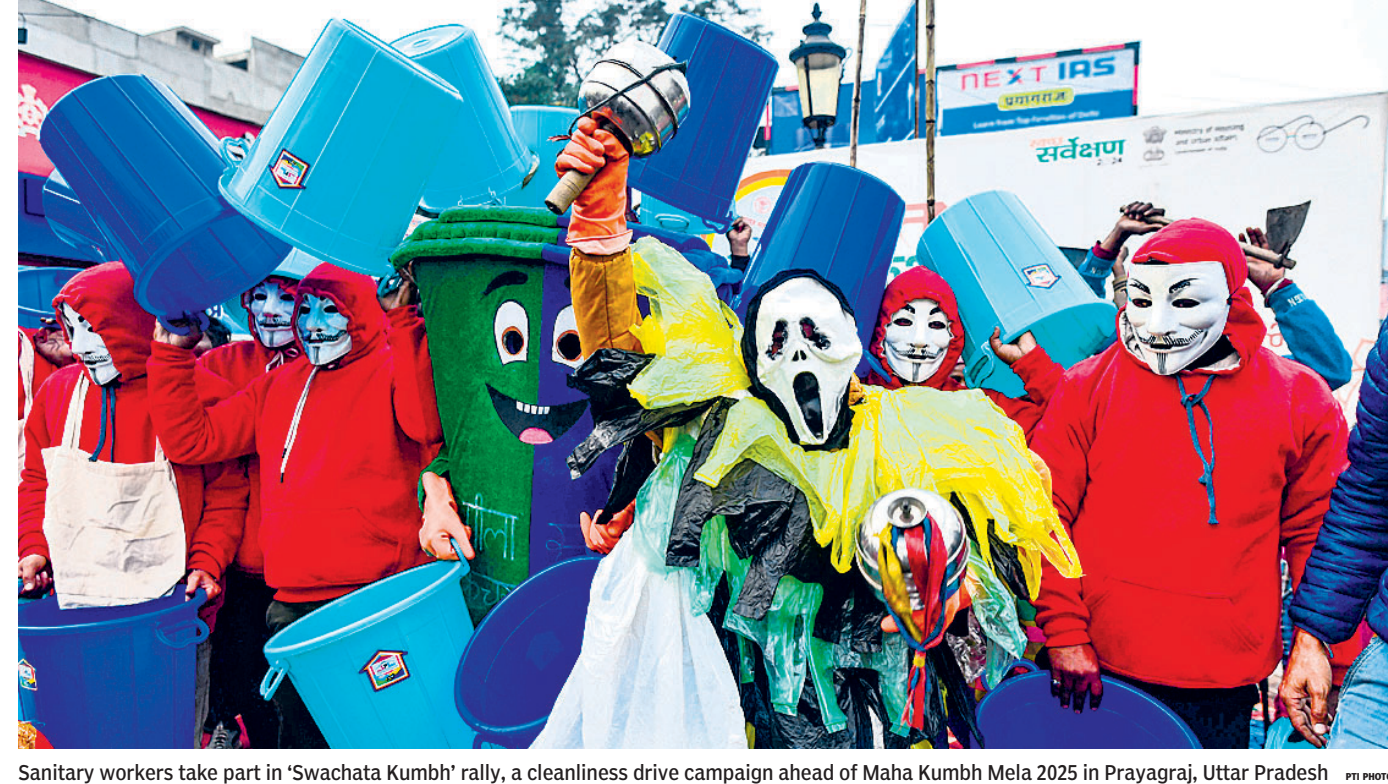
Sanitary workers take part in 'Swachata Kumbh' rally, a cleanliness drive campaign ahead of Maha Kumbh Mela 2025 in Prayagraj, Uttar Pradesh

"Ask anyone...after the country got independence, who thought about the visionary subject of Jal Shakti? Even my journalist friends will not be able to answer because the truth was suppressed to give credit to one person....water resources of India, construction of dams, the vision for all this - it was of one great man - Babasaheb Ambedkar," he said.