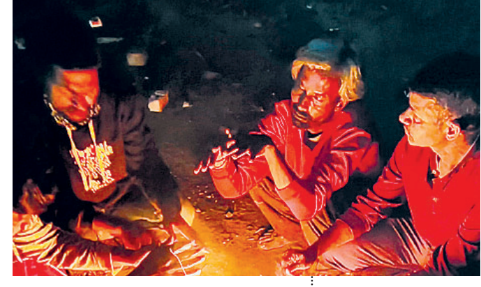
● Srinagar recorded a low of minus 7.3 degrees Celsius while Tabo in the Lahaul and Spiti district was the coldest place in Himachal Pradesh, recording a night temperature of minus 10.6 degrees Celsius ● Cold weather conditions persisted in states like Punjab, Haryana, Rajasthan and parts of Uttar Pradesh

The Met office has predicted a dip of two to three degrees in the minimum temperatures in Kashmir over the next two days. Except in Gulmarg, the