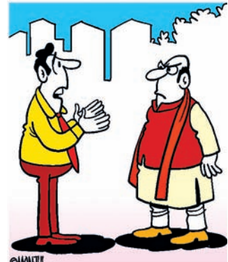
Before One Nation, One Election, can we at least have One Nation, One GST number?