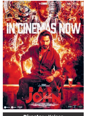
Director : Kalees Cast: Varun Dhawan, Keerthy Suresh, Wamiqa Gabbi, Rajpal Yadav & Jackie Shroff

Released Wednesday, Baby John is more than just a film. It offers a cinematic experience that cements Varun's position as one of Bollywood's finest this year. The film features a perfect blend of emotions, action, music, and masala entertainment with a message. This movie is a complete mass family entertainer. It is directed by Kalees, the film reflects Atlee's signature touch of grandeur and emotional depth, delivering a narrative about women safety that strikes a chord with the audience.