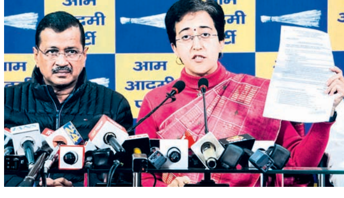
PRESS TRUST OF INDIA

New Delhi, Dec 25: AAP national convenor Arvind Kejriwal claimed Wednesday that Delhi Chief Minister Atishi may be arrested in a "fake" case by the central investigative agencies at the behest of the BJP.