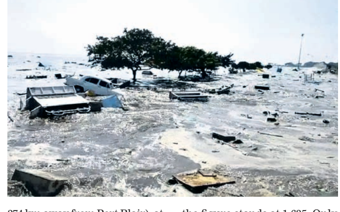
274 km away from Port Blair), at Teressa Island, 54 died and six missing, at Chowra, 41 died and 17 missing, at Campbell Bay, 20 died and 520 went missing. At Katchal Island (in Nicobar district), the maximum number of persons went missing and the figure stands at 1,635. Only one person died in Katchal in the tsunami. At Kamorta and Trinket Islands (both in Nicobar district), 295 and 75 people are still missing. One each died from these two islands.

As per government statistics, 269 people died while 583 went missing at Car Nicobar (nearly